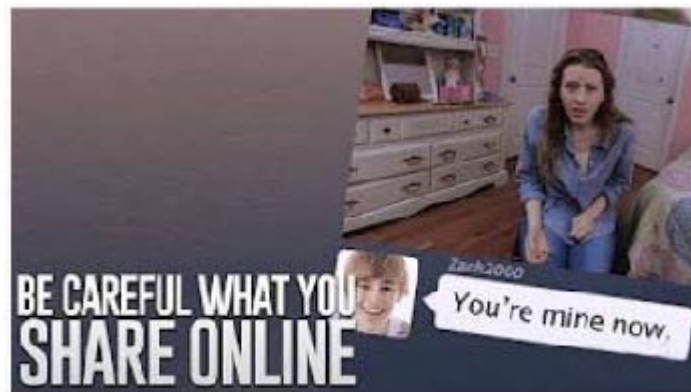
Be Careful What You Share Online

Video was produced by A21 in consultation with the U.S. Department of Justice and NCMEC.